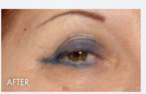
TATIANA P. Improvement in: wrinkles