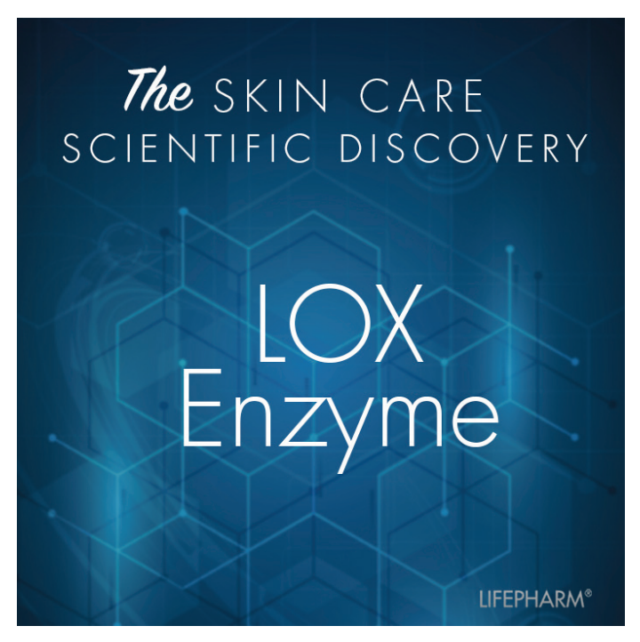
WHAT TO SAY: The new scientific discovery you've never heard of transforms your skin in as little as three days.