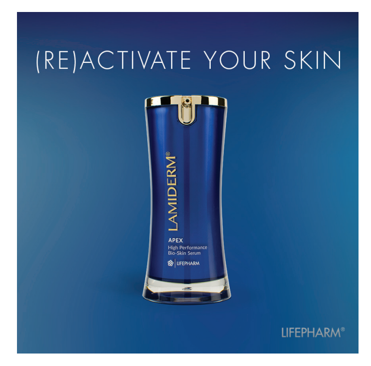
WHAT TO SAY: Lamiderm Apex activates your skin cells for healthier skin from the inside out.