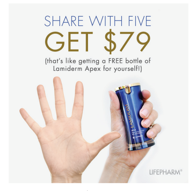
WHAT TO SAY: Earn $79 when you try Lamiderm Apex and share with five people. That's like getting a free bottle of this high performance serum for yourself!