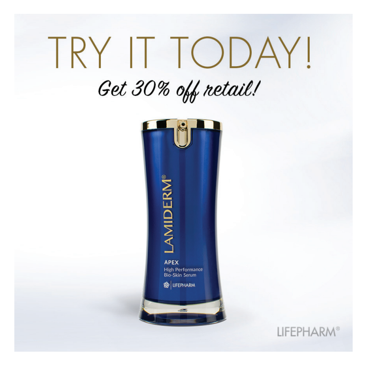
WHAT TO SAY: The all new Lamiderm Apex is more than just a pretty bottle. Experience the difference research-based skin care can make.