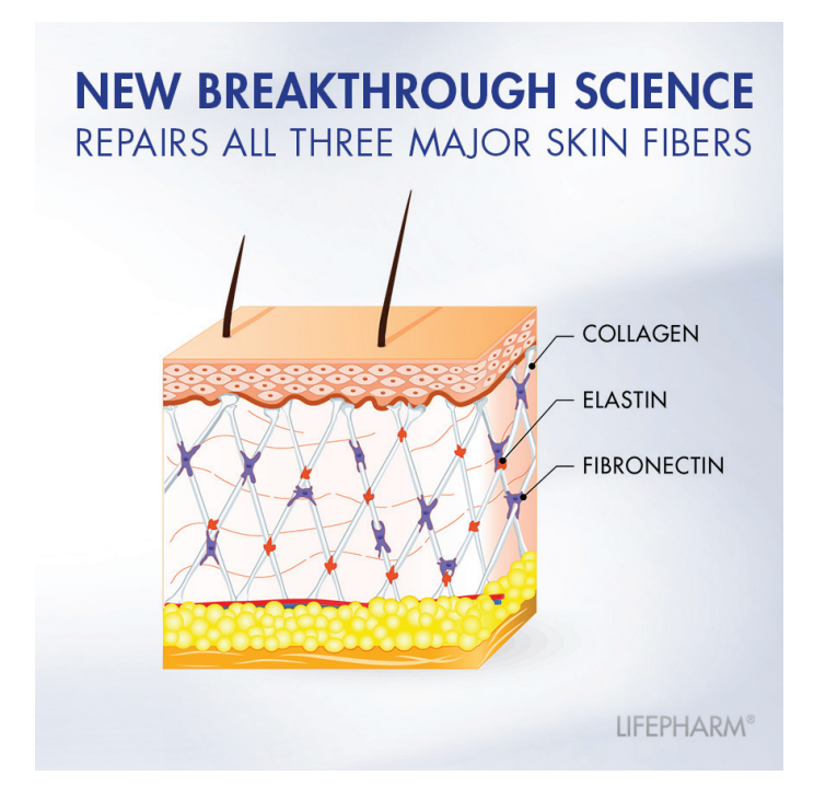
WHAT TO SAY: Lamiderm Apex: scientifically proven to target all three of your major skin fibers: