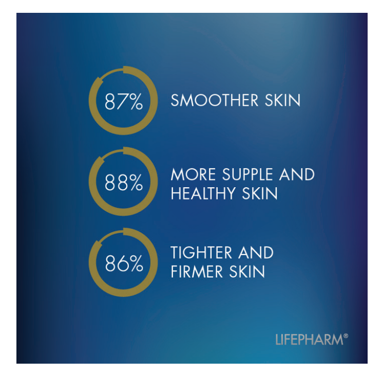
WHAT TO SAY: Transform your skin in as little as 10 days!