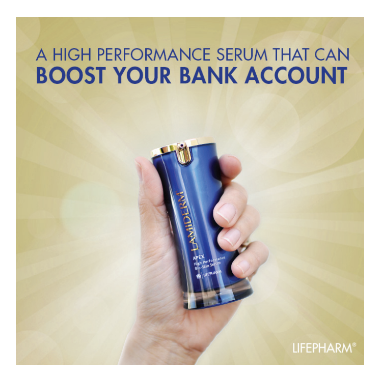
WHAT TO SAY: One competitively priced product that WORKS. Plus, you earn cash when you share it!